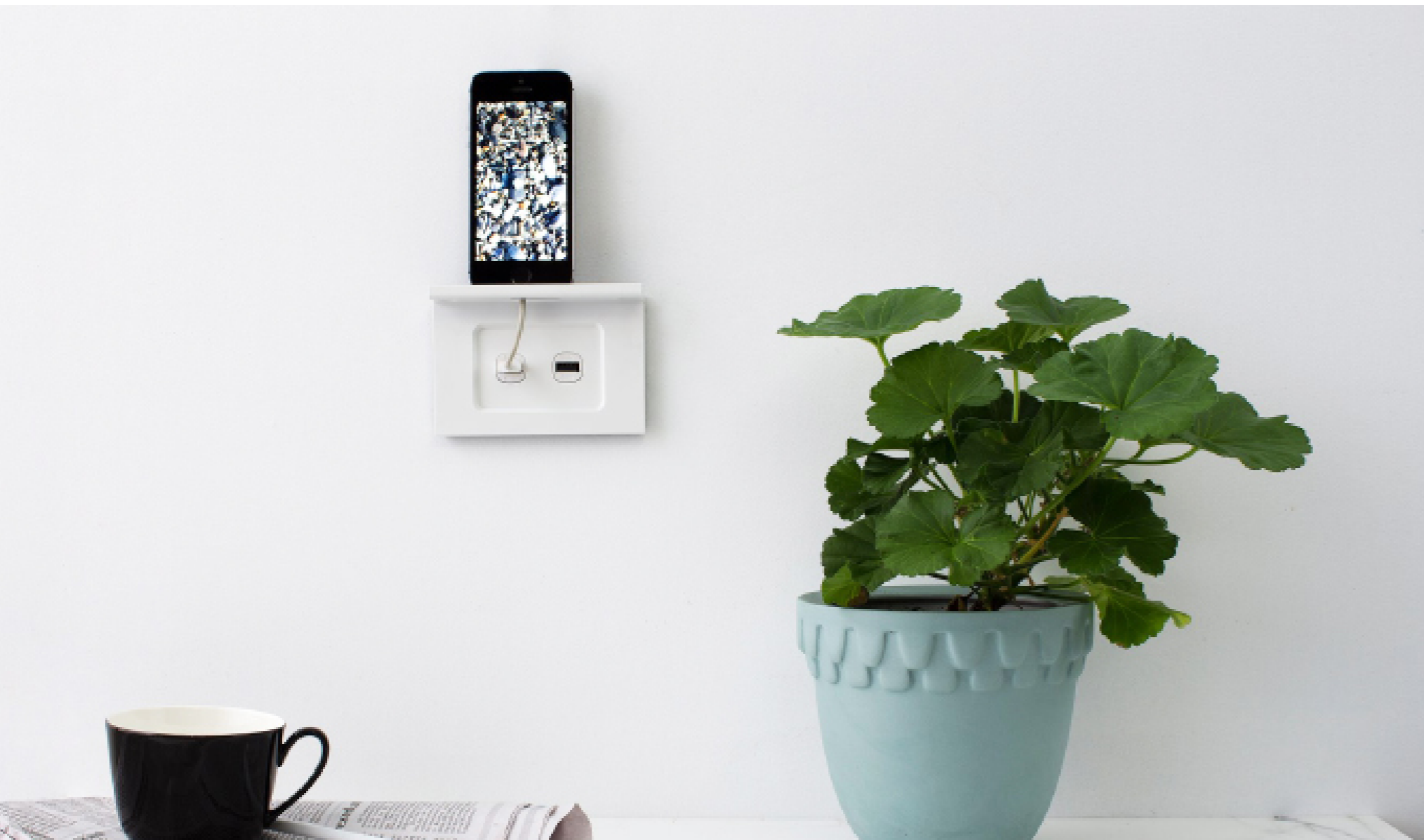
Product: Clipsal Saturn Zen USB Charger with Smart Shelf