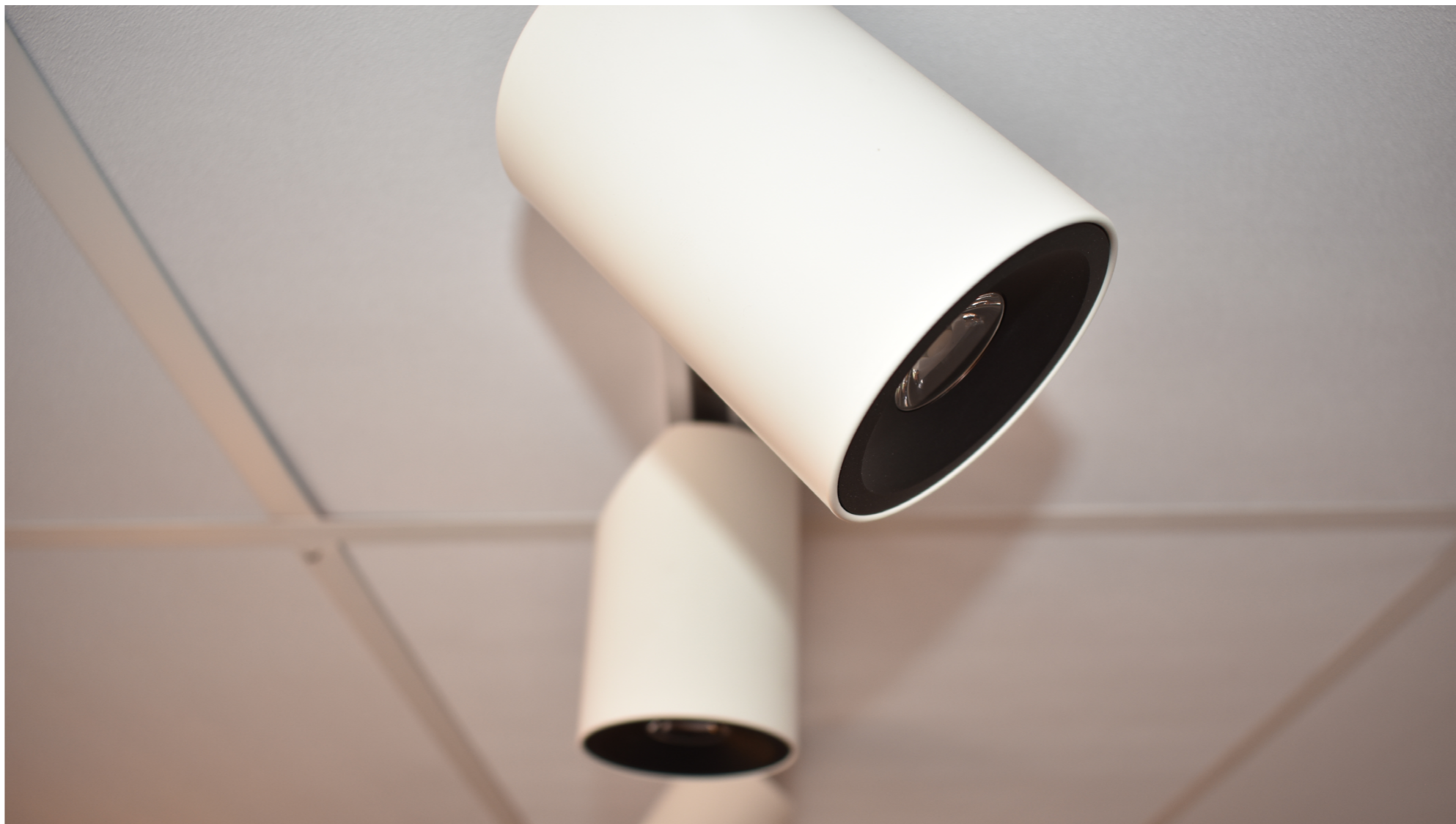
BrightGreen lighting displayed in the Green Efficient Living showroom.