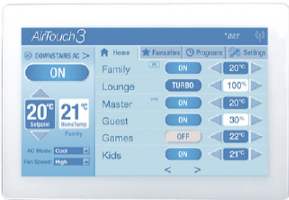
Polyaire AirTouch 3