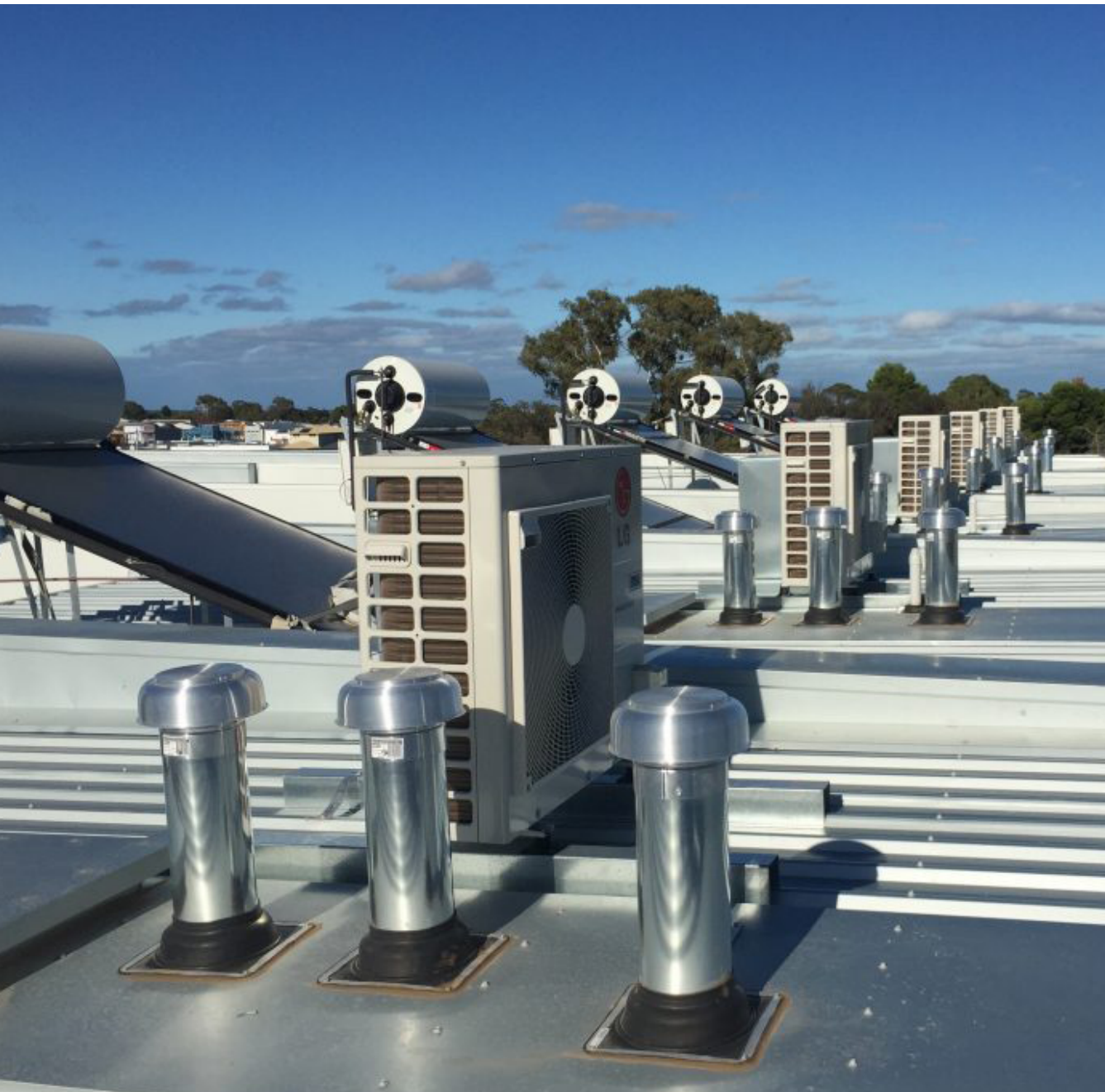
Commercial air conditioners installed by Green Efficient Living